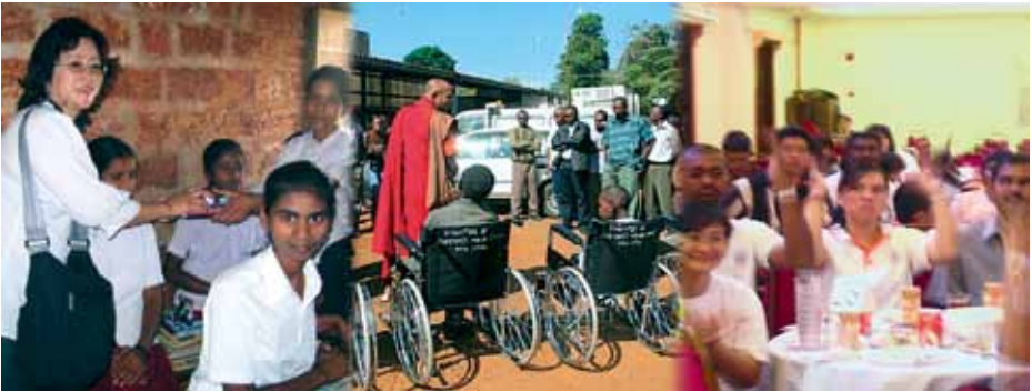
Helping the Untouchables